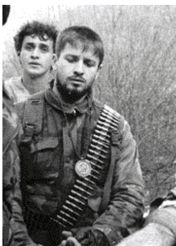
Naser Oric, main commander of the Muslim forces in the Srebrenica enclave.

Groups of armed Muslims in and around Srebrenica responded to these massive ethnic cleansing operations with a wave of coordinated attacks on Serb villages, which started in all earnest on 15 May. The villages initially targeted were Viogor, Orahovica and Osredak. These first operations were intended to link up various centres of Muslim resistance and create a compact Muslim-controlled territory in a semi-circle west of Srebrenica (at the perimeters of which lay Potocari, Srebrenica, Sucaska, and Zeleni Jadar). 618 During these attacks, Serb villages were plundered and burned down, and several Serbs were killed. Generally, however, the number of Serb casualties was low because most of the population (particularly women and children) had already taken refuge in Bratunac or elsewhere. On 16 May, Serb forces carried out a counterattack from Milici, trying to raid the Muslim stronghold of Sucaska west of Srebrenica. But local commander, Zulfo Tursunovic, managed to overcome the Serbs, a victory that cost both Serb and Muslim casualties. 619 Serb forces retaliated by encircling the village of Zaklopača, a few miles west of the town of Milici. There, they carried out a massacre the very same day,