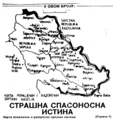
The terrible, salvation-bringing truth