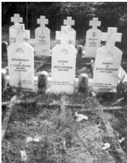
Graves of Serb victims of the Muslim assault on the village of Fakovici, October 1992