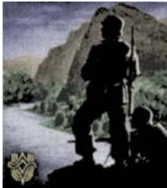
Ustashe iconography depicting the Drina as the unconquerable border of the Independent State of Croatia ( http://cro.ustasa.net/images/drina2.jpg )