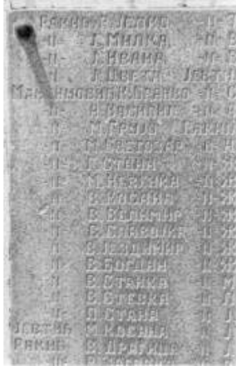
Part of a World War Two monument in Zalazje, commemorating the massacre that occurred there in June 1943, listing the names of Serb victims.